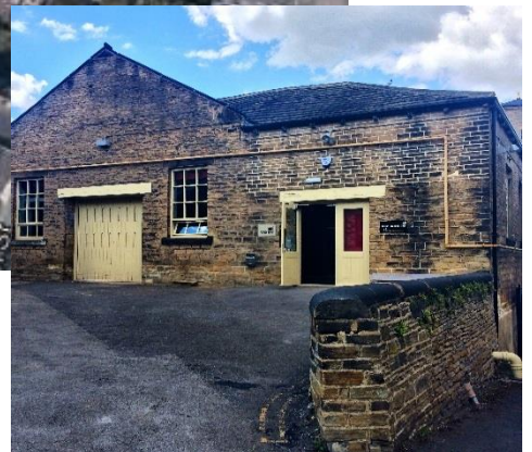
Our entrance from Main Yard